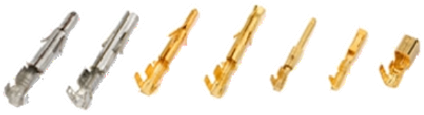
Applicable terminal types

When crimping, the conductor part needs to be crimped, and then the insulation part needs to be rolled and crimped twice. Please ensure that the handle is not excessively compressed, which may damage the insulation of the wire